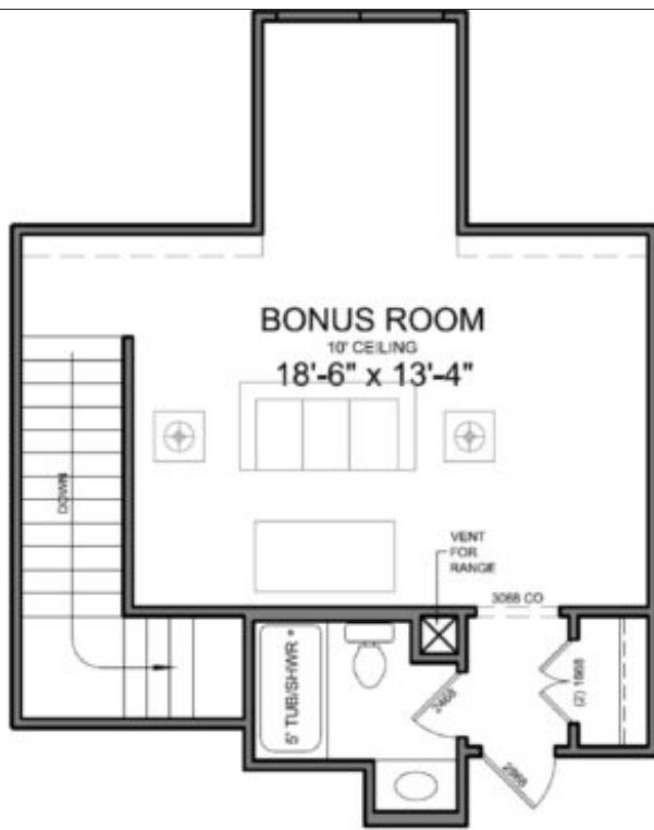
Floor Plan (2)