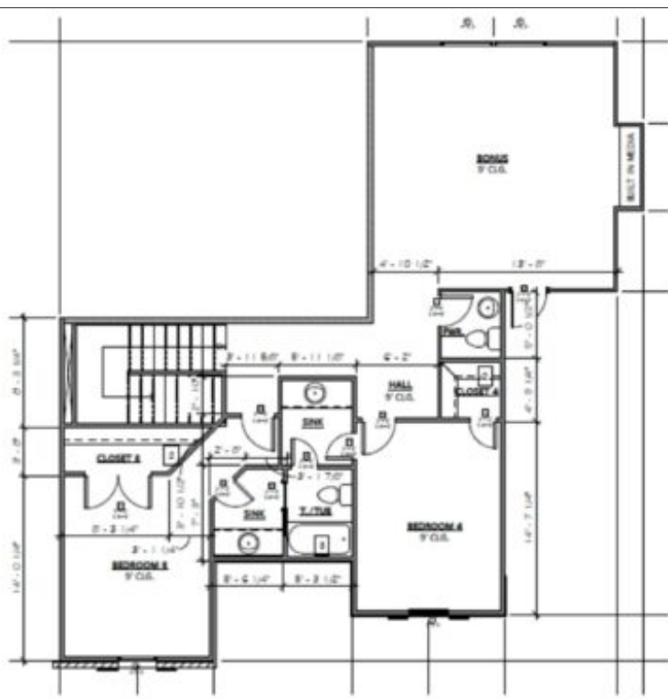
Floor Plan (2)